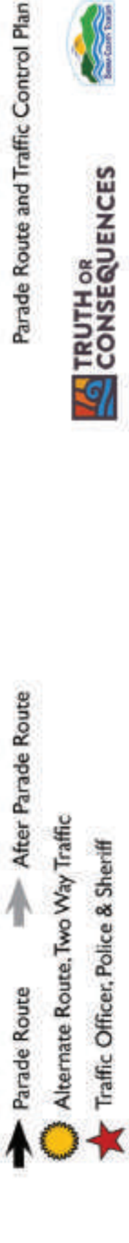
Parade Route and Traffic Control Plan